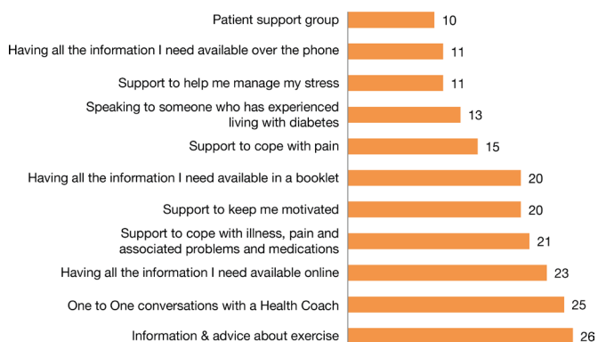
Figure 2 Summative analysis of 163 responses to questionnaire about diabetes services.